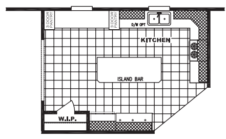
BROOKLINE KITCHEN OPT

AMQ32724AH / 4 beds / 3 baths / 2,160 sq. ft.